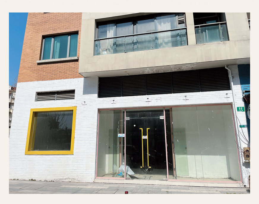
Second edition: Fudan Used Bookstore is moving to a new location with more space and its own shop front. — Ti Gong